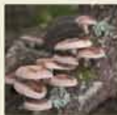
Shiitake mushroom workshop Feb. 19