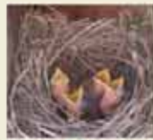
Nature walk at Hammock Bay Feb. 2