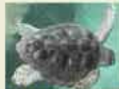
Learn about sea turtles at Topsail Feb. 3