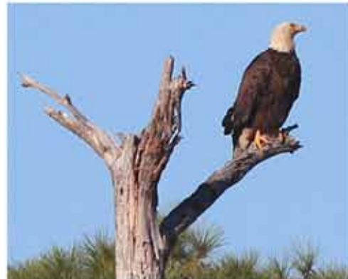
Photo: The bald eagle population is doing well in Walton. This adult was photographed perched along Western Lake in South Walton. Several other pairs have been spotted along the coastal dune lakes and the Choctawhatchee Bay. Click here to learn more.

Great time of year to take a hike and explore the outdoors. Below are a few of our feature stories along with a lineup of great outdoor events. For more info, check out the menu items at the top of the Walton Outdoors website : Paddle, Hike North Walton or South Walton, explore the Parks/Beaches, Springs, RV/Camping and more Upcoming Events.