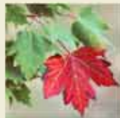
Ornamental tree lecture at Coastal Branch Extension office Feb. 6